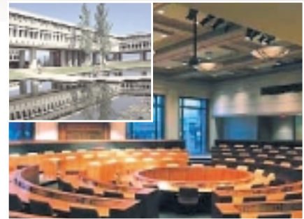
Simon Fraser University - Vancouver

The Simon Fraser University is a world class conference facility that contains 17 meeting rooms in addition to the Asia Pacific Hall and is housed in a restored historic building, originally constructed in 1920 for the Toronto Dominion Bank. Auditel equipment was chosen by the university as the conference microphone and simultaneous interpretation system for the Asia Pacific Hall. The 154 position system features computer controlled delegate name handling, electronic voting, local sound reinforcement at each delegate position, automated camera control (which projects the delegate's face automatically upon microphone activation) and 8 language simultaneous interpretation. The microphones can be controlled by both computer and a mimic control console (shown above) in tandem by an operator and the chairman.