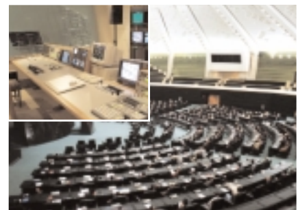
Iranian Parliament building

Supply of a complete voting and sound communications system for the Ministry of Housing in conjunction with the Sony Corporation of Dubai, for the supply of the TV broadcast equipment. The installation covers sound reinforcement, voting systems, audio and TV in the new parliament chamber for 316 members, plus a secretariat and 18 separate committee rooms. The whole system is computer-controlled and linked to a central TV centre which automatically activates cameras to pick up on the current speaker.