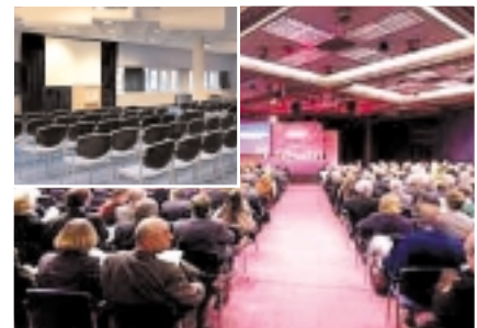
Queen Elizabeth II conference centre

In the very heart of London, the award winning Queen Elizabeth II Conference Centre specialises in events of 40 to 1,000 delegates, and offers the finest facilities for meeting planners in the UK. The Centre combines modern comfort with the very latest in technology. The Churchill Auditorium, the Whittle, Flemming and Elizabeth Windsor rooms are just some of the rooms that were equipped with Auditel conferencing and interpretation systems. All these function rooms are cleverly designed for total flexibility in layout styles and delegate numbers.