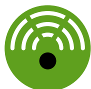
TCS 2500 Mobile Digital Conference System