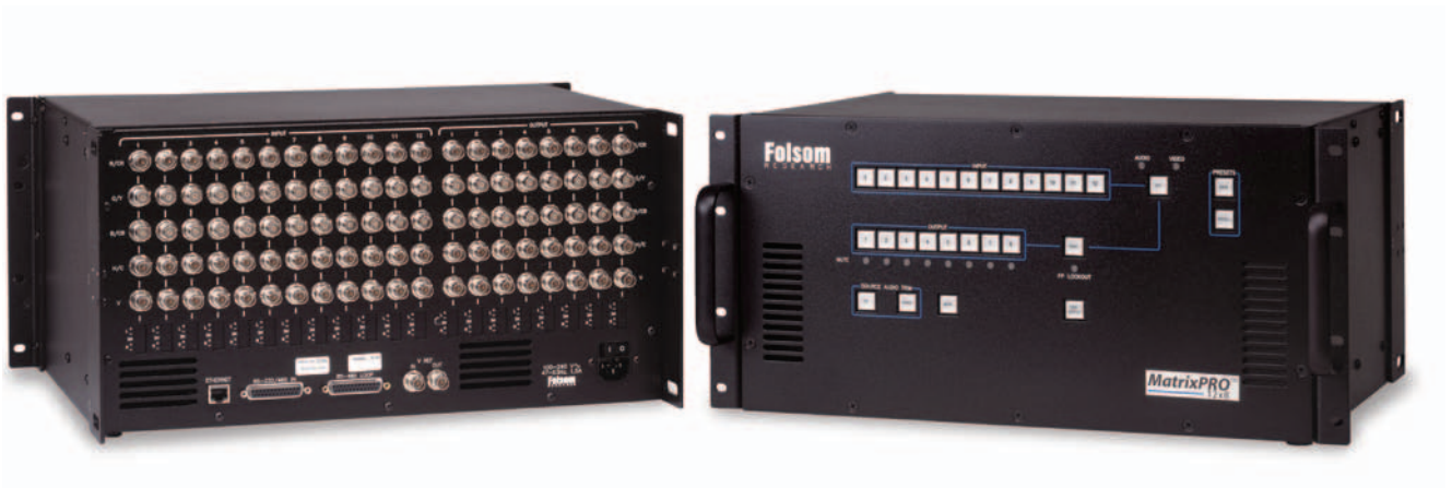
MatrixPRO 12 x 8 Matrix Switcher