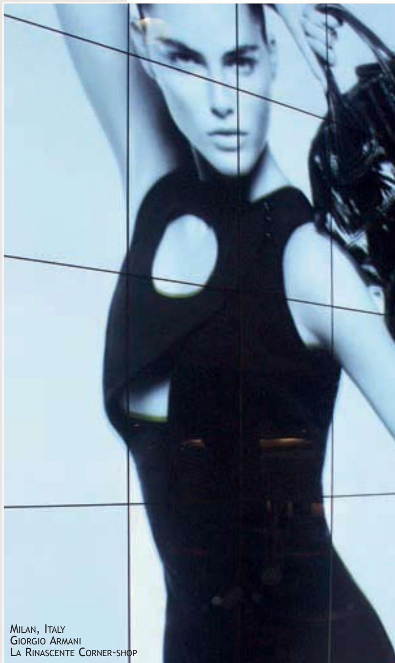
MILAN, ITALY GIORGIO ARMANI LA RINASCENTE CORNER-SHOP

THE PERFECT WAY TO CAPTURE EVERYONE'S ATTENTION.