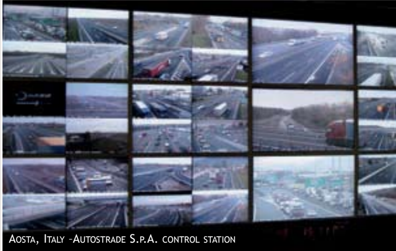
AOSTA, ITALY - AUTOSTRADA S.P.A. CONTROL STATION

The sturdy aluminum structure that makes up the external body of the module allows easy and quick installation, thanks to four anchoring holes, and easy maintenance of the video wall itself.