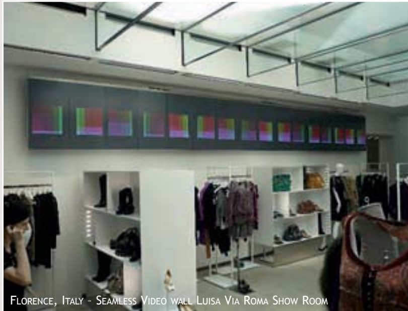
FLORENCE, ITALY - SEAMLESS VIDEO WALL LUISA VIA ROMA SHOW ROOM

The SUN-Readability characteristics are only for FID and PID, Flights and Public Information Display, applications, where data must be readable in extremely bright light, viewed at an angle of more than 180° both vertically and horizontally, have a high contrast ration, 1,200:1, and a brightness of 700 cd/mq and a WXGA resolution.